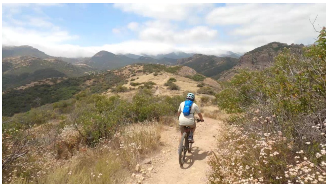
Mountains to the south