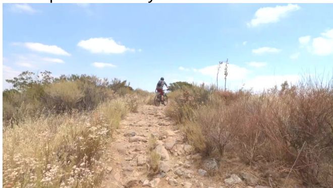
Some parts are rocky