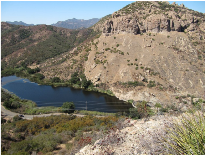
Lake Eleanor and the Sentinel