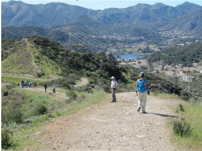
White Horse Canyon