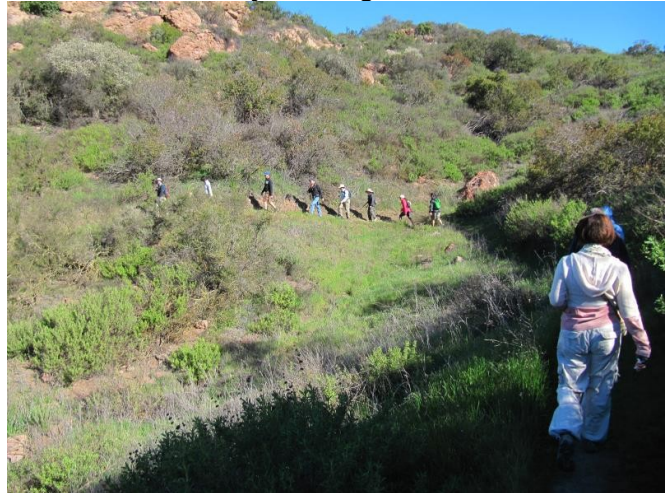
White Horse Canyon Singletrack