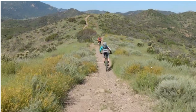
Whitehorse Canyon Trail