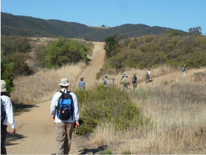
Los Robles Trail, near the start