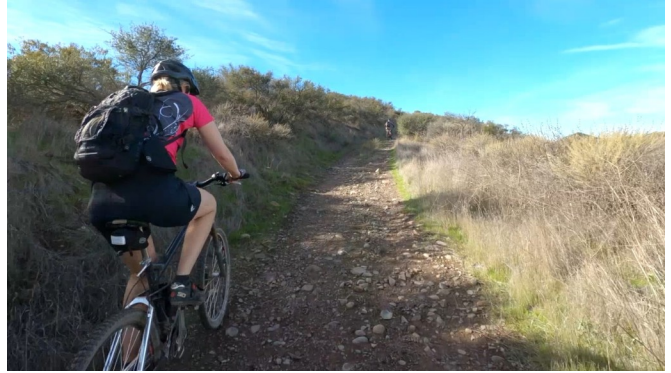
Los Robles South