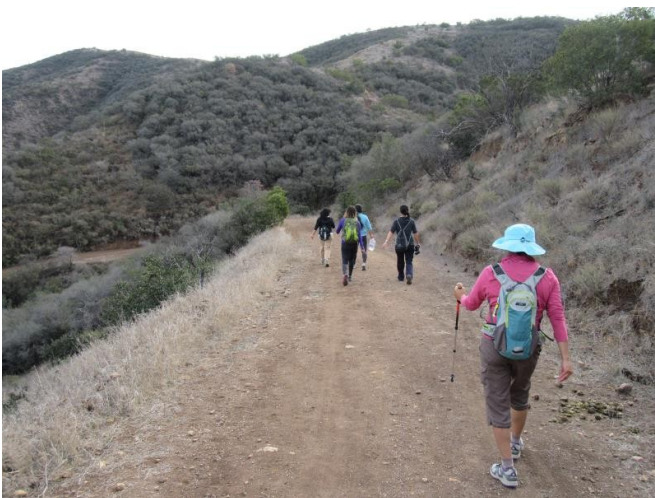
Los Robles Trail (East)