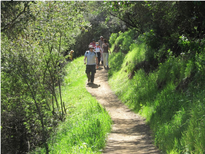
Lily Tomlin Trail