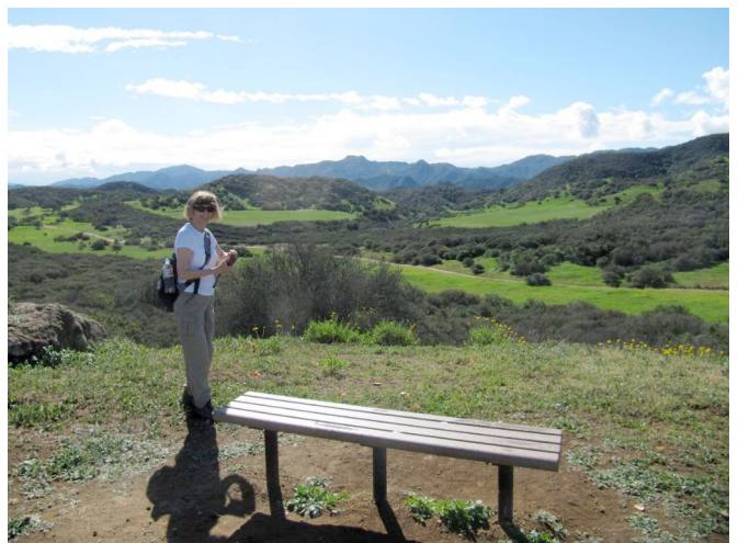
Los Robles Overlook