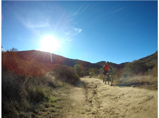
Los Robles Trail, towards Lily Tomlin Trail