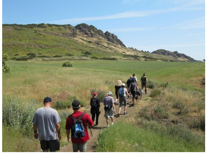
Lizard Rock Trail switchbacks