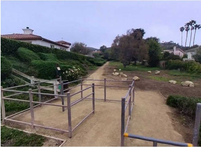
El Encanto Trail