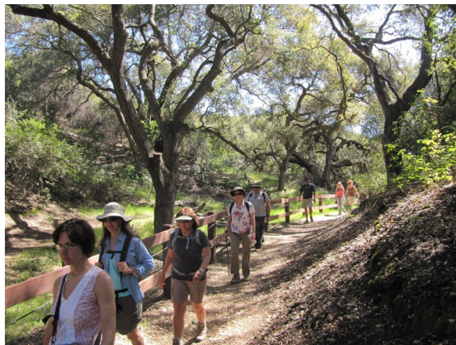
Mr. Toad's Wild Ride