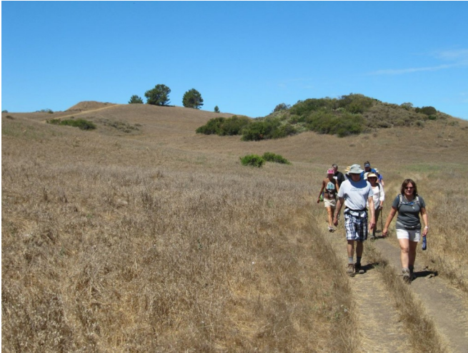
Looking west over the Olympia Farms site