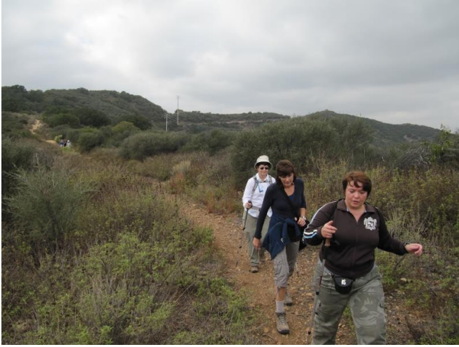
The steeper, looser south fork of the Bobcat Trail.