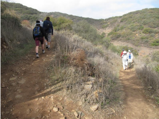
Triunfo Canyon Trail