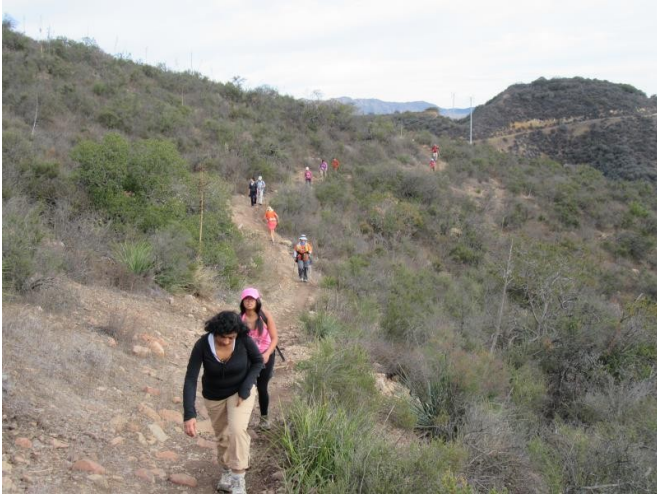
Los Robles Connector (South)