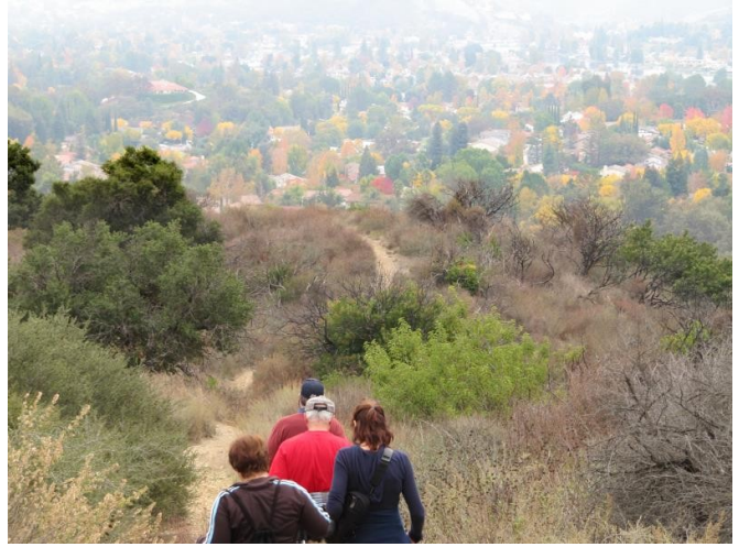
Los Robles (East)