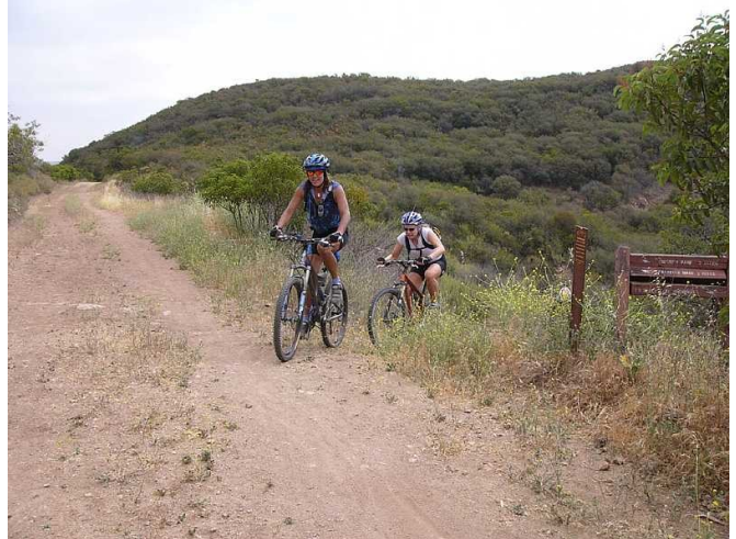
Whitehorse Canyon Trail Meets Los Robles (East)