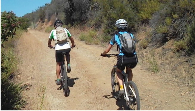
Los Robles Trail (East)