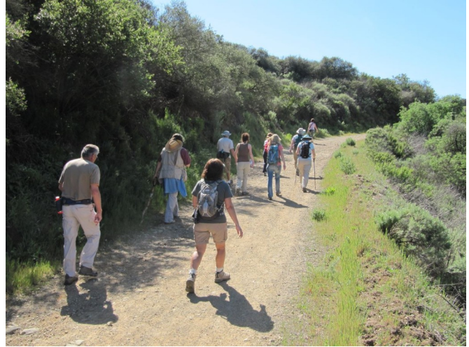
Los Padres Trail