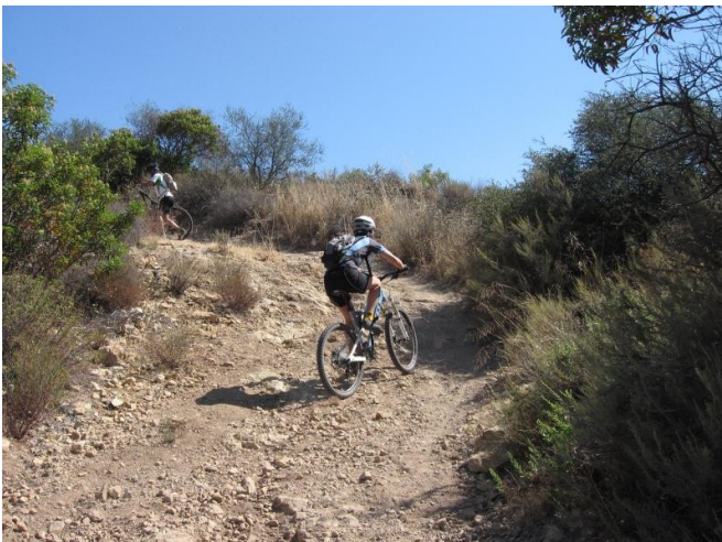
North end of WHC Trail is rocky and steep