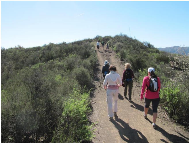
Whitehorse Canyon (WHC) Trail