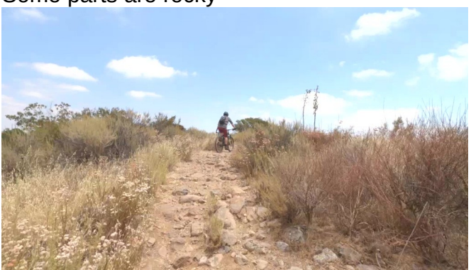
Mountains to the south