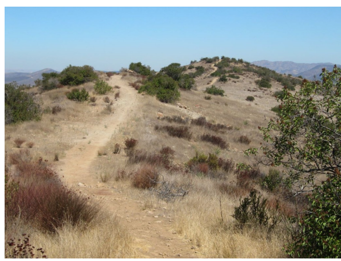
Take only photographs and leave nothing, not even tracks!