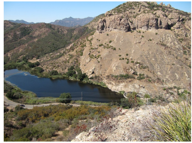
Lake Eleanor and the Sentinel